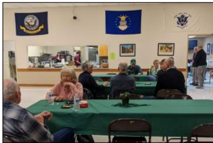
Folks attend the post social on March 17, 2022.

If you are new to Post 3063, normally the post hosts a monthly business meeting on the first Thursday of the month at 7 p.m., with a light dinner and refreshments served at 6 p.m. We will continue to offer a Zoom option for attending since a virtual option works better for some members with or without the threat of Covid.