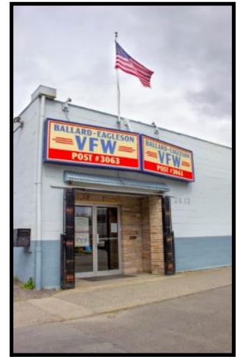
Ballard Eagleson VFW Post 3063 is located in the Ballard neighborhood of Seattle at 2812 NW Market St.

May 24, 2022 – Community Shredder Day in post parking lot.