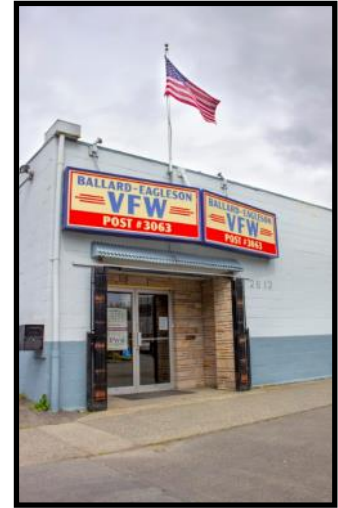
Ballard Eagleson VFW Post 3063 is located in the Ballard neighborhood of Seattle at 2812 NW Market St.

October 23, 2021 – VFW Post 3063 Spaghetti Dinner and Fundraiser. Tickets are available for $20 at the post or online. We are also accepting donations for the virtual auction and raffle. For more information, read this newsletter or go to vfwseattle.org/index.php/fundraising .