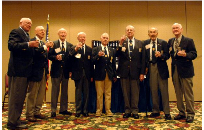
Eight of the surviving 16 Doolittle Raiders raise their goblets for their fallen brothers during their 64th reunion in Dayton, Ohio, April 18, 2006.

The original article was edited due to space constraints. It can be viewed at vwseattle.org .