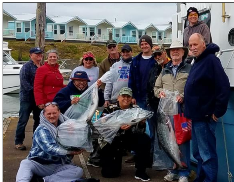
Group photo in Westport after fishing.