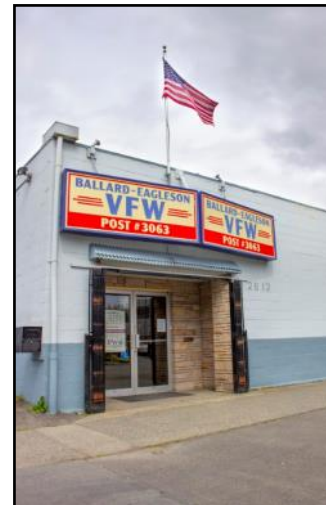
Ballard Eagleson VFW Post 3063 is located in the Ballard neighborhood of Seattle at 2812 NW Market St.

November 16, 2022 - VFW Post 3063 Monthly Social * VETERANS THEMED, wear something from your service!