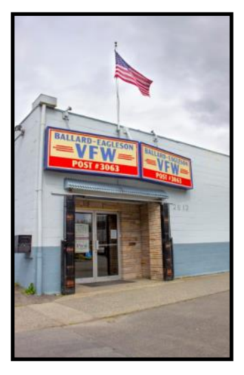
Ballard Eagleson VFW Post 3063 is located in the Ballard neighborhood of Seattle at 2812 NW Market St.

October 23, 2021 – VFW Post 3063 Spaghetti Dinner and Fundraiser. Tickets are available for $20 at the post or online. We are also accepting donations for the virtual auction and raffle. For more information, read this newsletter or go to <a href="wyfwseat-tle.org/index.php/fundraising">wfwseat-tle.org/index.php/fundraising</a>.