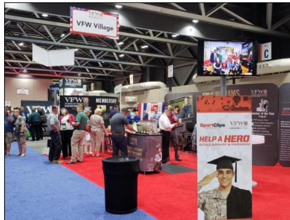
VFW Village in Exhibition Hall.

Tuesday's highlight was the appearance of the President of the United States, Donald Trump. Among other subjects, he spoke on issues with favorable direct bearing for the military, veterans, military personnel and their families. The president acknowledged the importance and need for the Veterans of Foreign Wars as a congressionally-chartered veterans organization. Prior to the president's appearance, Marine Lt. Col. (ret.) Oliver North was introduced and given the VFW Distinguished Service Award. Also on Tuesday afternoon was a patriotic celebration for all delegates attending the convention.