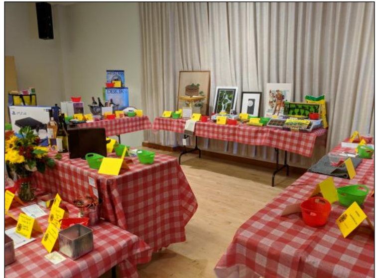
A sampling of the raffle prizes included art, dinner gift certificates, and vacation houses. There was something for everyone as there were more than 60 raffle prizes.

Thank you to all who attended and come again next year!